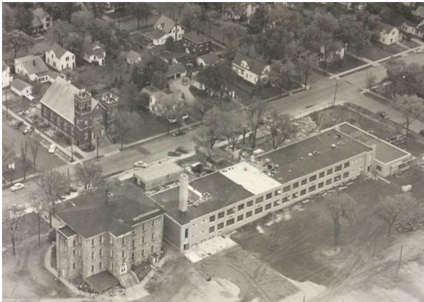
The present Howe Elementary School is on the right and the old Howe Elementary/High School is the two-story building on the left. Immanuel Lutheran Church can be seen in the background.