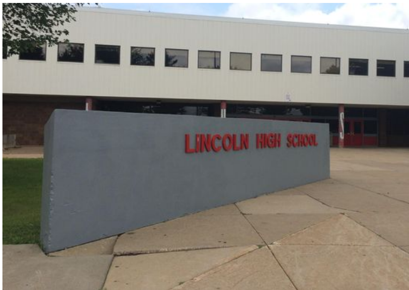
The current Lincoln High School is at 1801 16th St. S.